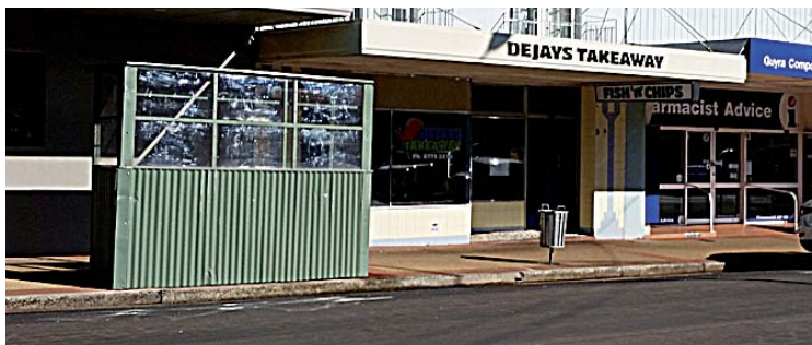
New location for the iconic street stall shelter

gled to collect enough funds to cover the cost of their raffle prize, and is now reconsidering whether it is worthwhile to continue with their fundraising ef-