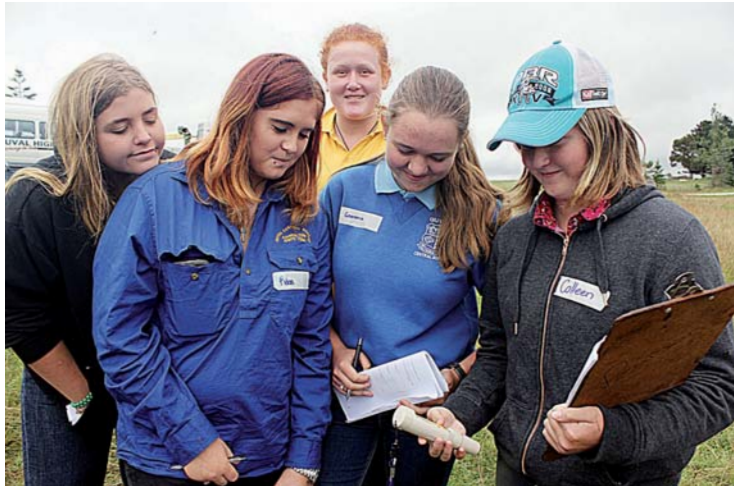
Guyra Central School students take a pH reading to test the acidity levels of the water on-farm at the 2017 Schools Property Planning Competition Field Day.

the information gathered during the property planning field day to prepare a management plan that will maximise profitability and ecological sustainability on Waratah.