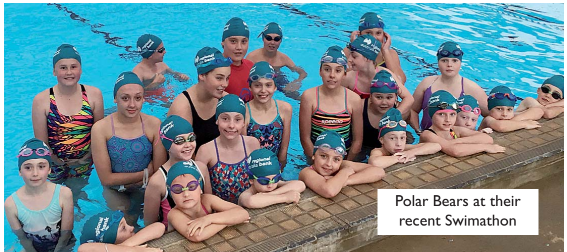
Polar Bears at their recent Swimathon