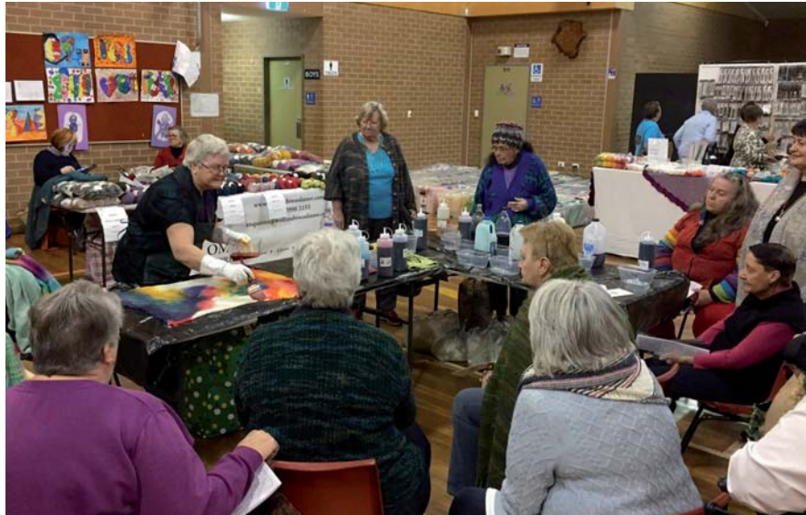
Demonstrations and tutorials were popular