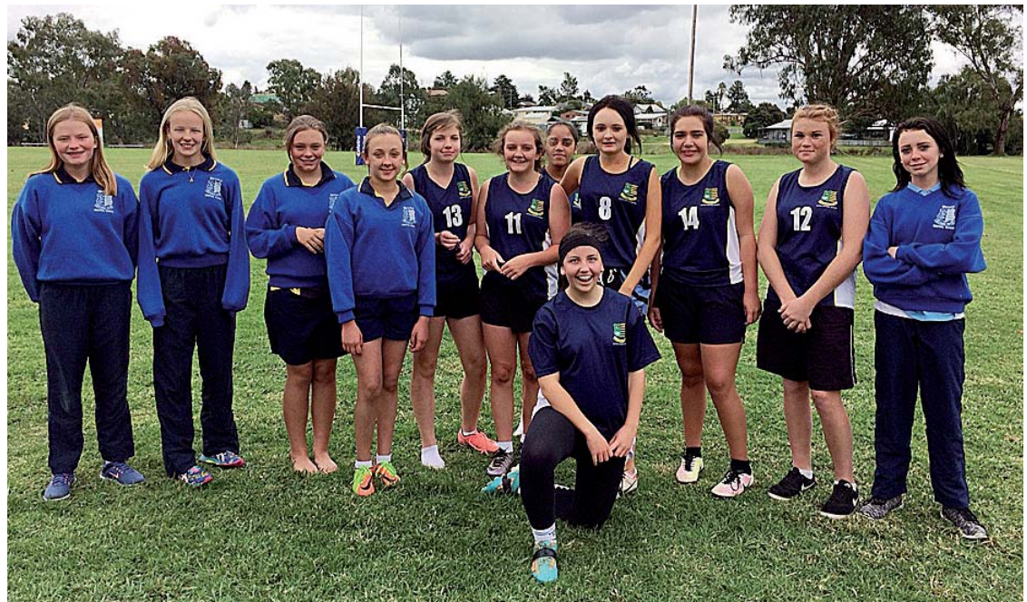
Above: GCS Girls League Tag team Below: 800m final at the Secondary athletics

The Secondary Athletics Carnival was held on Tuesday, May 2nd and the Primary Athletics Carnival will be held on Friday 5th May.