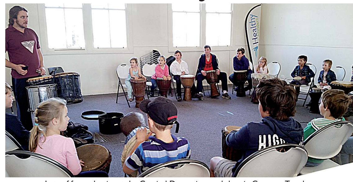
Lots of fun and noise at the Carnival Drumming workshop in Guyra on Tuesday

Armidale Regional Council is hosting a program of school holiday activities for children and young people across the local government area.