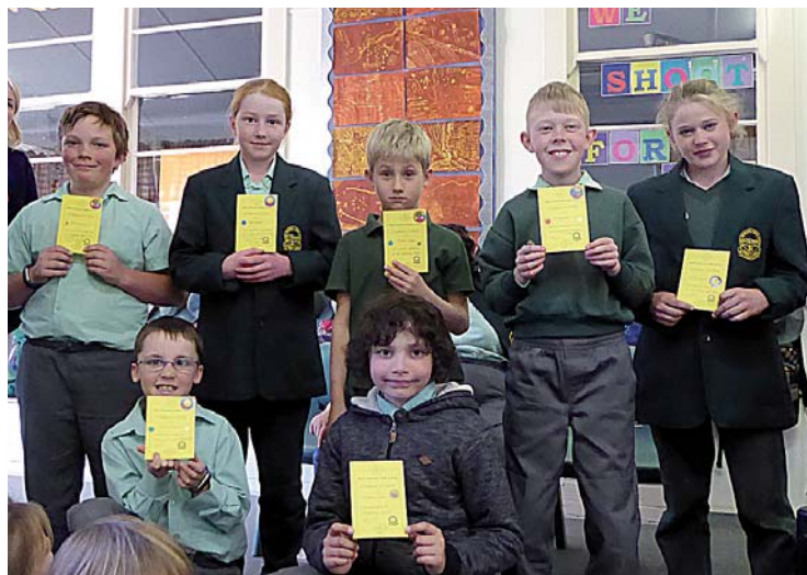
Above: Senior award recipients