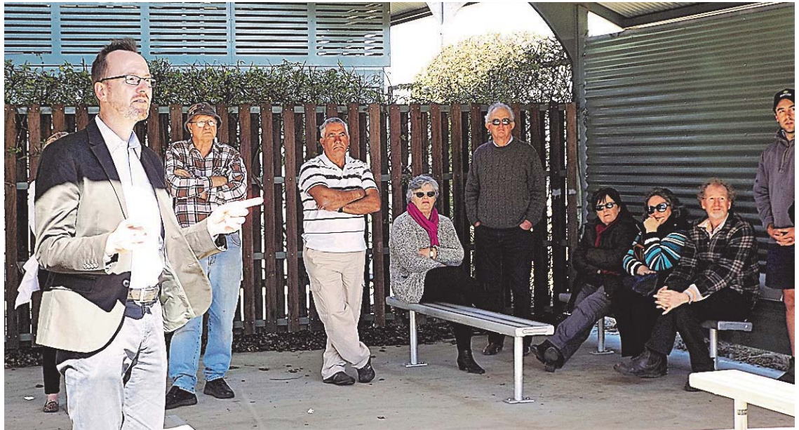
Greens MLC David Shoebridge talks up the chances of a de-amalgamation following the 2019 State Election

"Guyra was already co-operating by sharing staff, plant, and equipment with Armidale, so there was very