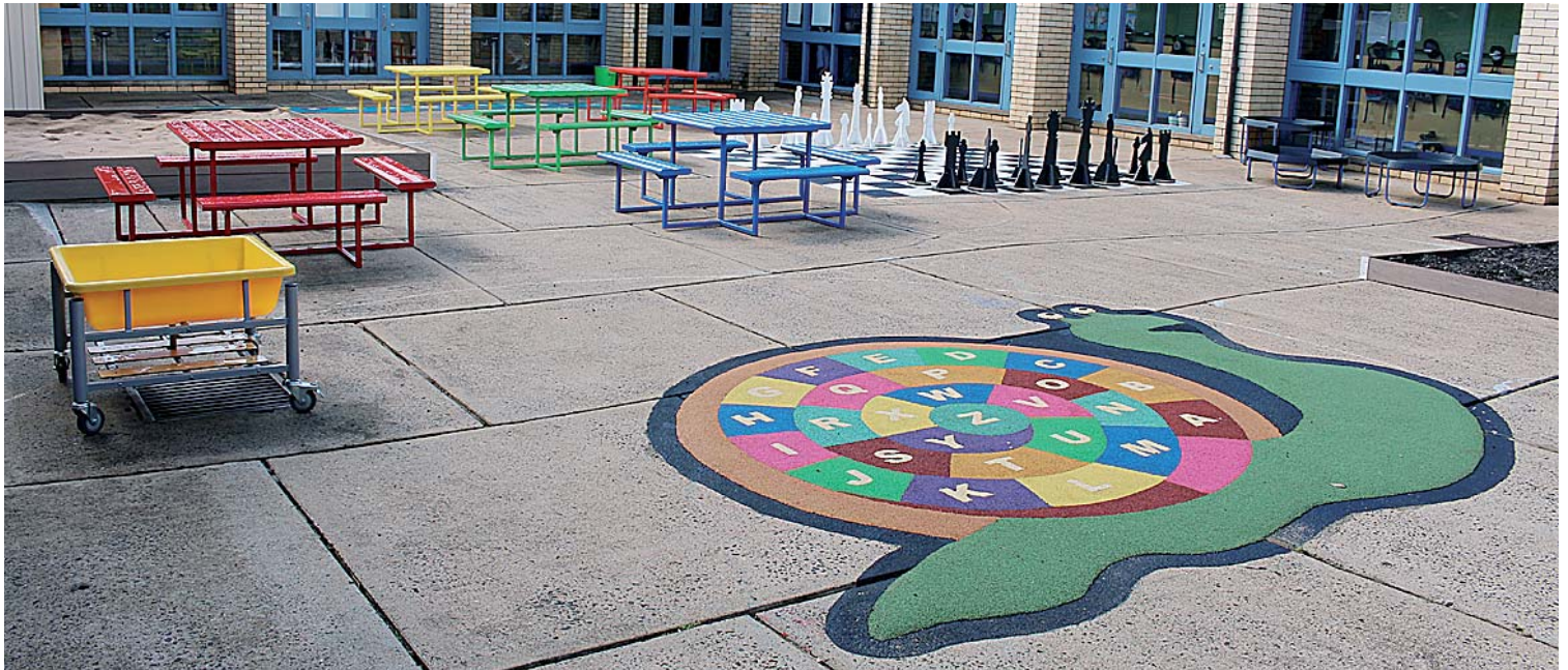
Transformation complete - before (left) and after (below)