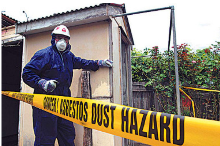
When Renovating, Go slow - Asbestos - it's a NO go! Visit asbestosawareness.com.au - To learn what you need to know!

"It can be in any home built or renovated before 1987; lurking under floor coverings including carpets,