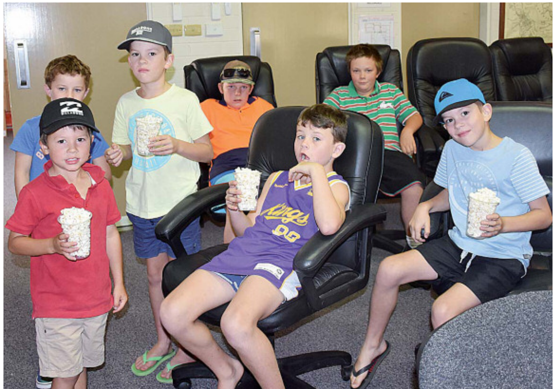
Ready with the popcorn for the school holiday movie 'Captain Underpants' on Tuesday

For more information and to see the full program go to the Armidale Regional Council's facebook page or visit the website http://www.armidaleregional.nsw.gov.au/council/council-events/school-holiday-activities