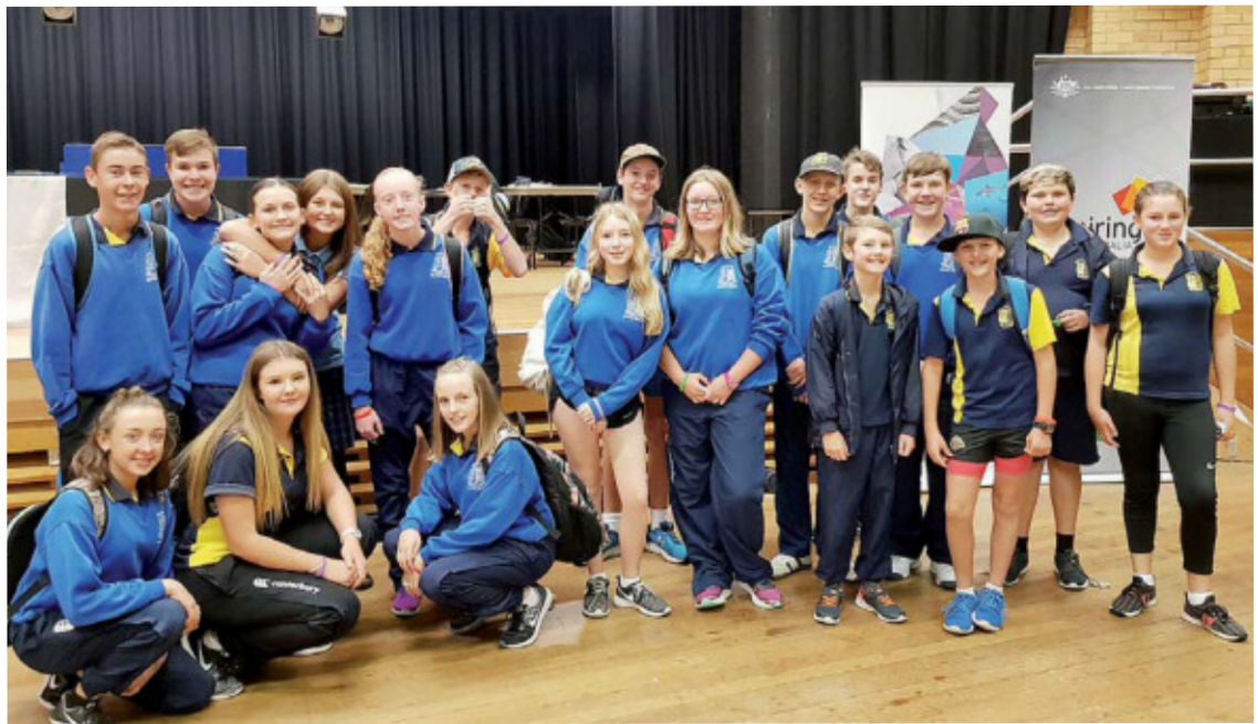
Guyra Central School participants in the 7-10 Science and Engineering challenge

Activities required teamwork, communication, critical thinking and creativity, each activity was scored with Guyra Central School placing 6th at the end of the STEM event.