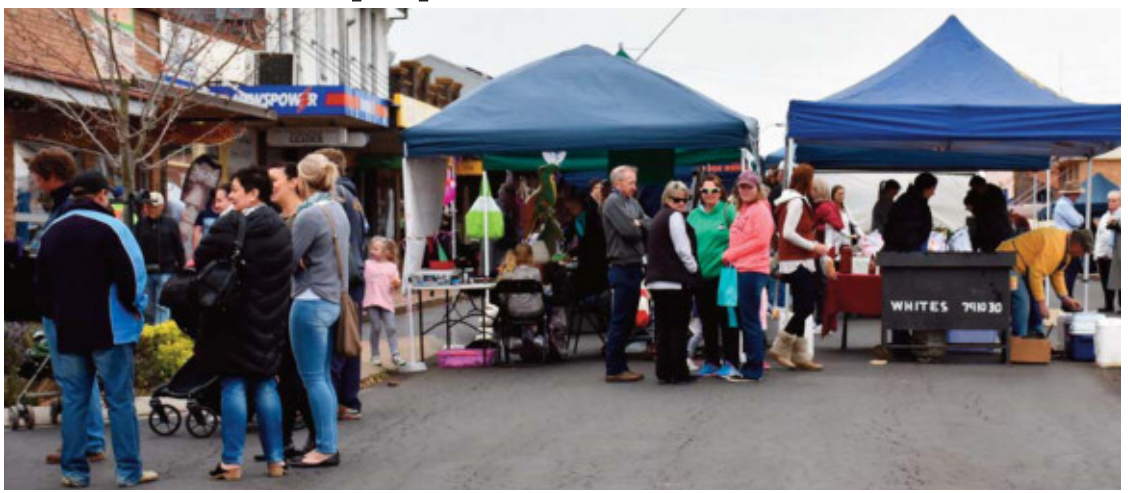
TroutFest is more than fishing and the organisers are looking for input from the community

A brainstorming discussion will be held at the Guyra Bowling Club next Tuesday April 3rd at 5.30pm and everyone is invited. If you have an idea for activities, entertainment or how the festival can be improved please come along and have your say.