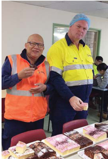
Costa Tomato farm held their biggest morning tea last Thursday for all employees (over 600 of them) across both sites and raised over $650 for the Cancer Council. Pictured are members of the Packing team (right) Tech & Agronomy team (above left) and the Quality team (above right). Special thanks to the Guyra Bakery for their delicious catering!