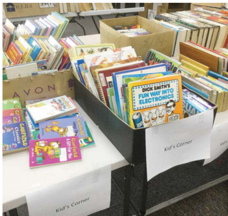
Books have been sorted into categories to make browsing easier

people to browse through the books and take their time to choose - with everything being electronic nowadays, it's still nice to get your hands on a book."