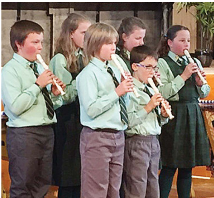
Years 3-6 students from Black Mountain received first place in the recorder section and second place in the ensemble section.

K-6 students received second place in the choral section and years 3-6 students received first place in the recorder section and second place in the ensemble section.