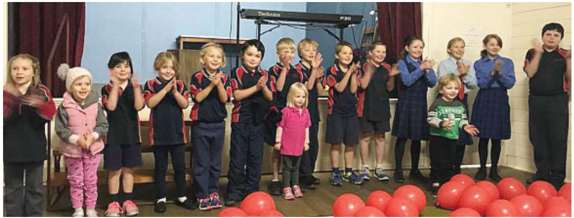
Ben Lomond students enjoyed being part of the performance

Enter 'Little Red' Kelly, clad in a red cape, skipping along