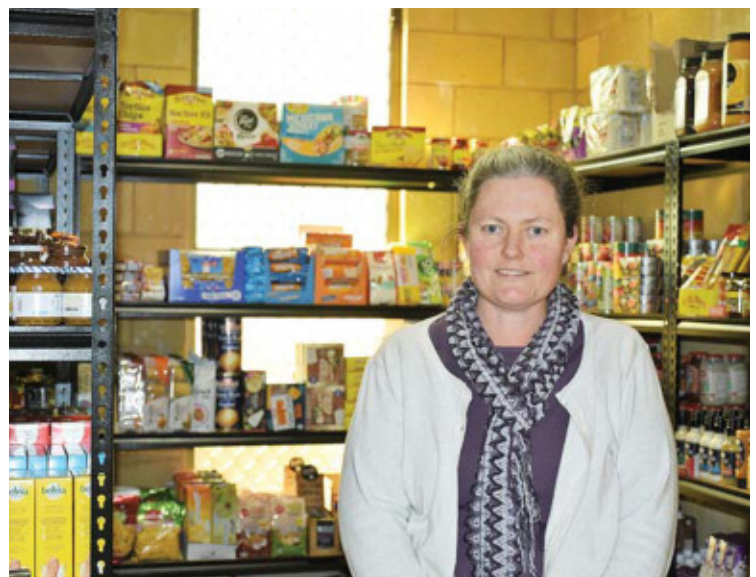
The Guyra Food Pantry will now be available for farmers who need a helping hand

Around 80 families are registered with the service, and between 10 and 20 visit each week.