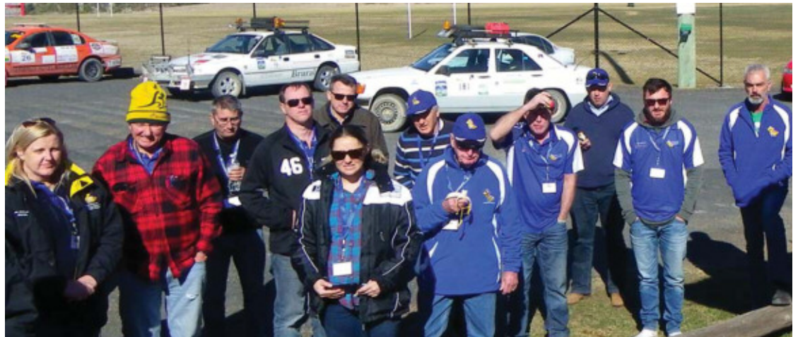
Above: Trekkers enjoyed lunch at Lions Park