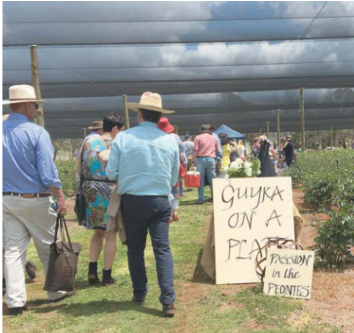
'Passion on the Peonies' was a highly successful event for the Guyra & District Chamber of Commerce who are now preparing to take their passion for Guyra food to the platform at the Guyra Railway Station

The next, and biggest, event for the Chamber is 'Passion on the Platform', which will be held on September 15th. Featuring produce from the local