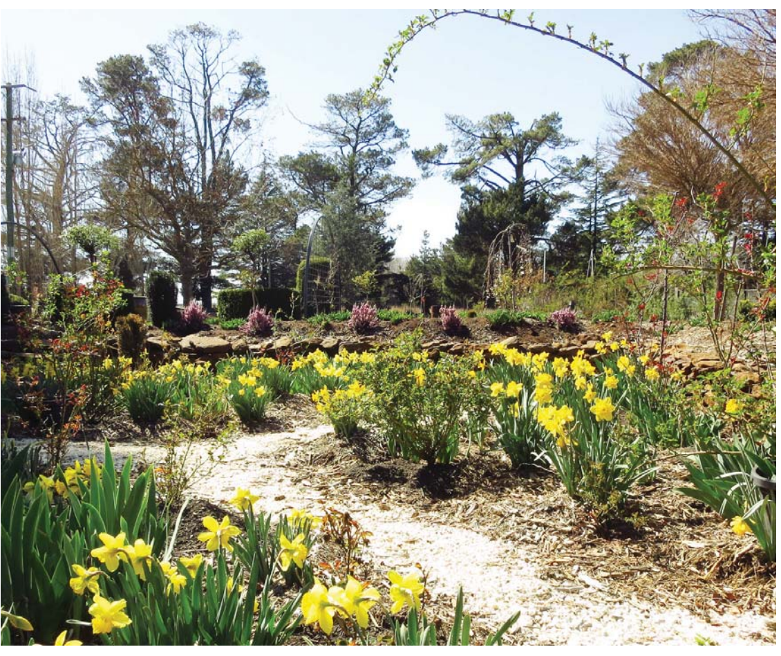
"Roseville" features daffodils, boronias, rhododendrons, magnolias and glorious showing of hellebore of every colour

"Rosewood" is located at 34 Robinson's Lane, heading west turn off Guyra Rd just past the town outskirts.