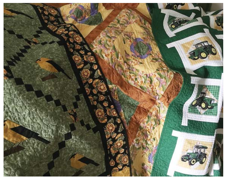
Three of the quilts that will be on display featuring intricate design and techniques

A display of quilts will take place over the weekend in conjunction with Trout-Fest. Hand-made quilts from around the Guyra district, Armidale and other locations will be on display.