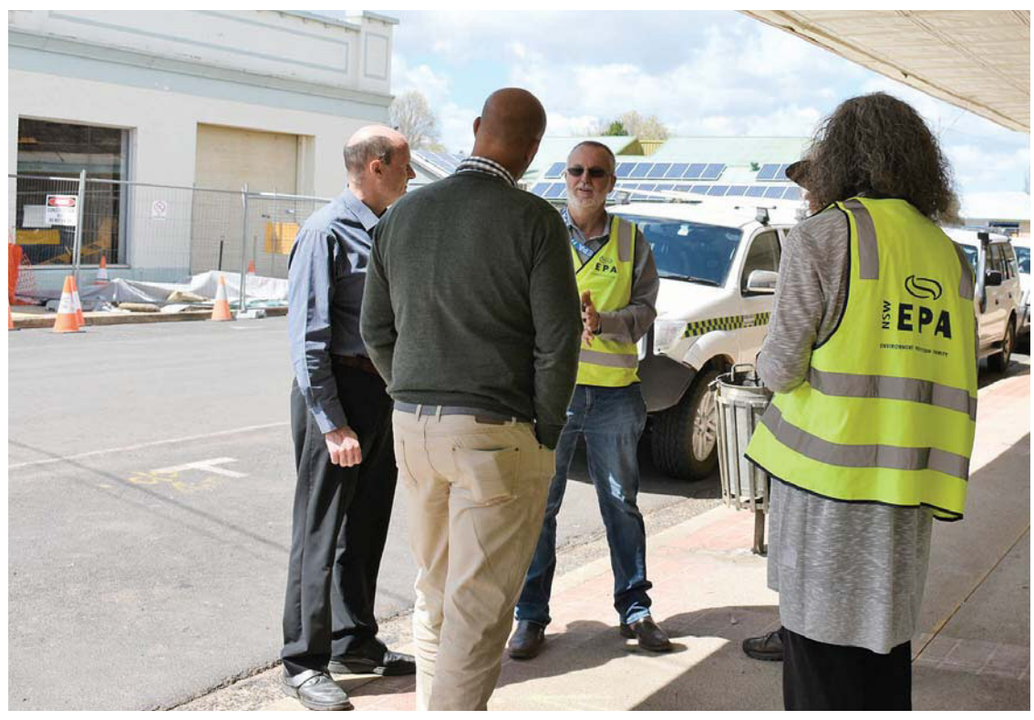
Council staff met with NSW EPA staff this week to discuss the removal of the tanks

Tenders close this week for the removal of fuel tanks from Bradley St. The tanks were discovered during preliminary works on the upgrade of the Guyra CBD, causing a considerable set back to the project.