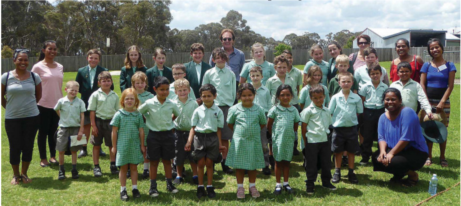
Black Mountain students welcomed five teachers from Nauru last week

The students of Black Mountain Public School were very fortunate last week to have a visit from five teachers in training from Nauru.