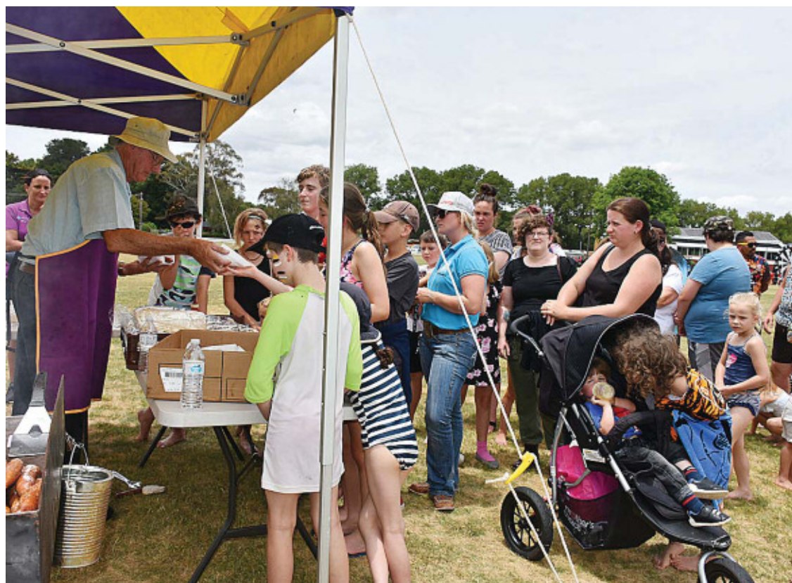
Food and drinks courtesy of the Lions Club