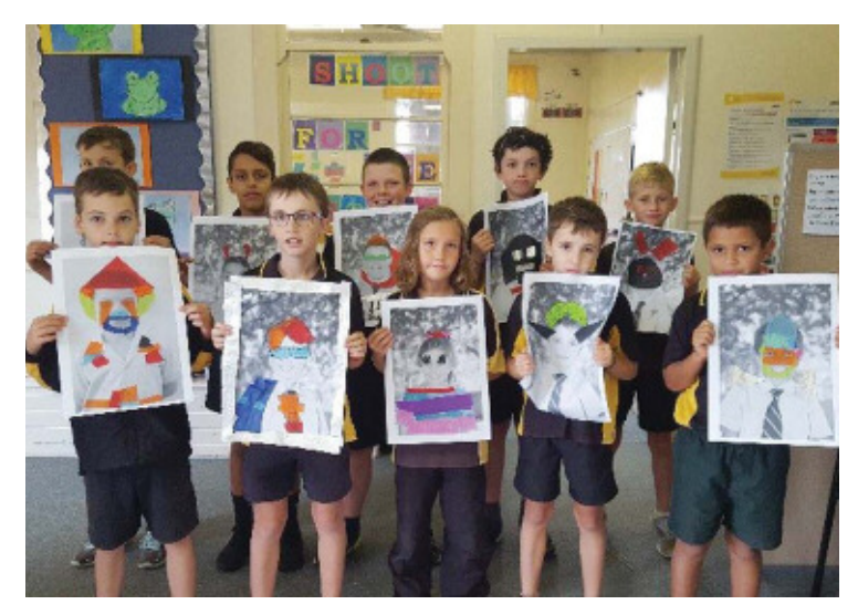
Students at Black Mountain are busy preparing artworks for the Guyra Show

Transition to Kindergarten continues every Friday this