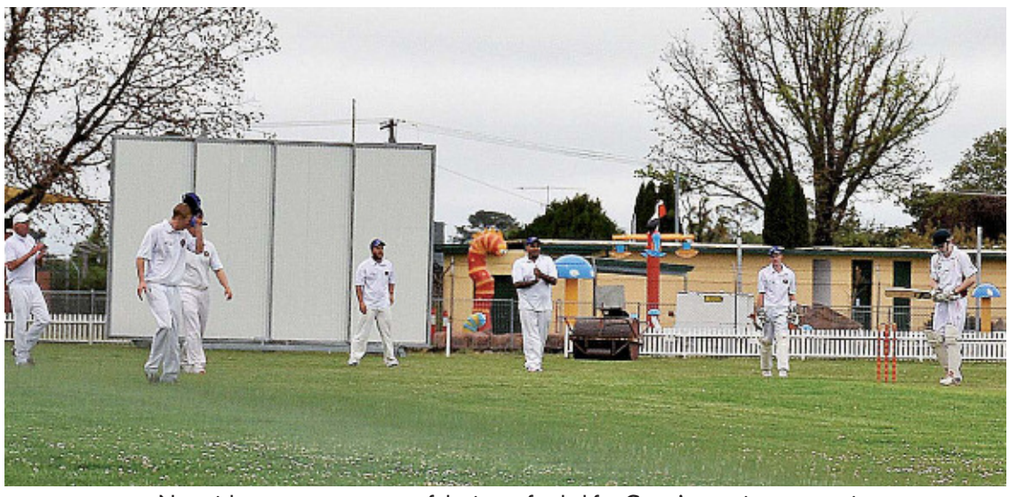
New sight screens were one of the items funded for Guyra's sporting community

The regional group replaces two subcommittees for the Armidale and Guyra districts,