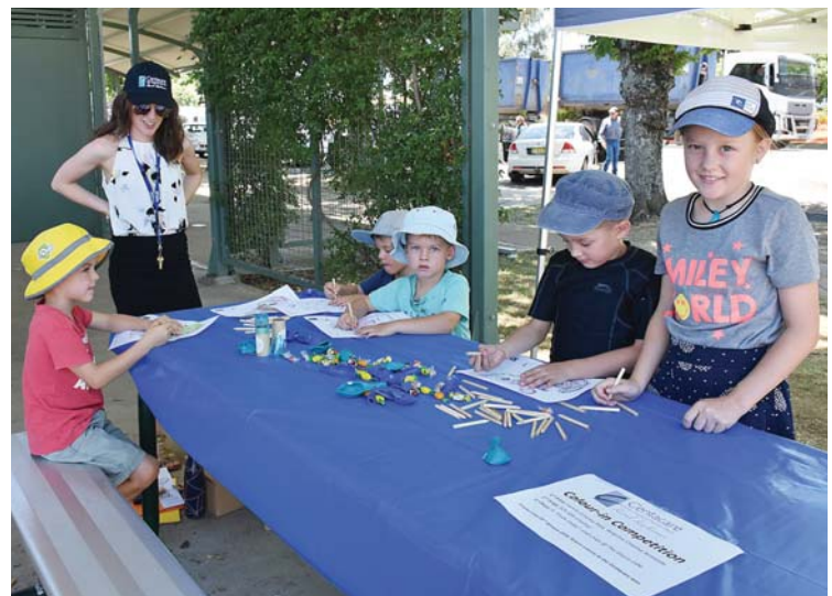
Centacare provided activities for children at the Lamb & Potato Festival, including the colouring competition

Thank you to Belgrave Cinema for their donations and to everyone else involved. Centacare NENW and PHN HNECC are committed to supporting the health and wellbeing of our local communities, by working together