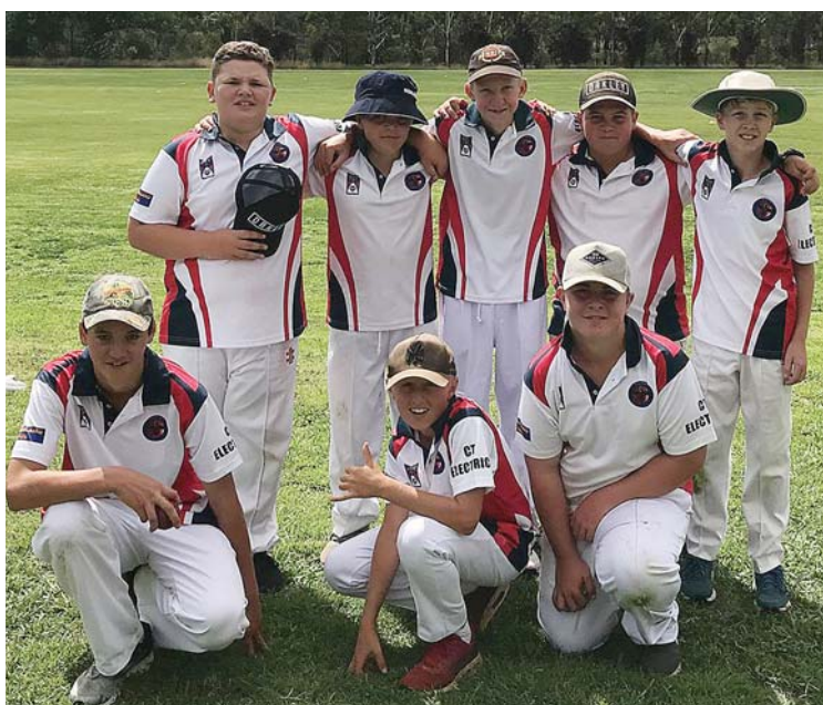
Under 14 Cricketers

Further enquiries please call Col Stanley 0447791775 or Brooke Burgess 0417060677.