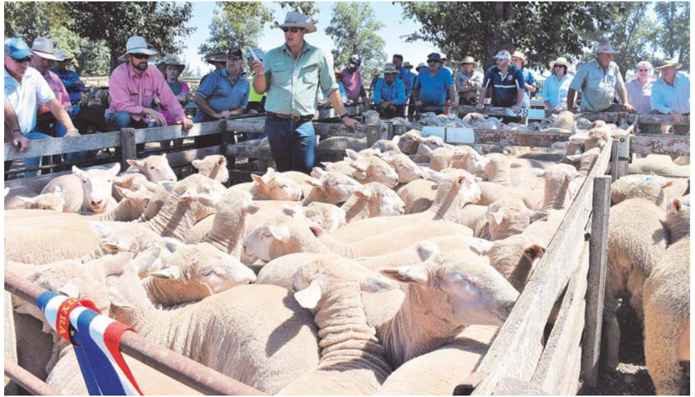
Last year's winning export pen - the hunt is on again for the best lambs in the district