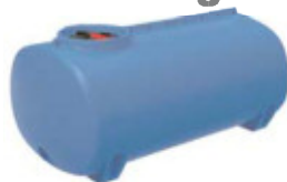
3000Ltr Cartage Tank