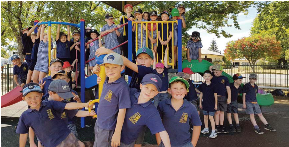
Stage one students from Guyra Central School on their Push and Pull Excursion