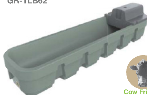
620Ltr Ballast Trough GR-TLB62