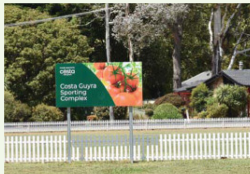
SPOT THE MISTAKE: Bright, shiny new signs, just not in the right place

New signage has been installed at Guyra's two main sporting fields.