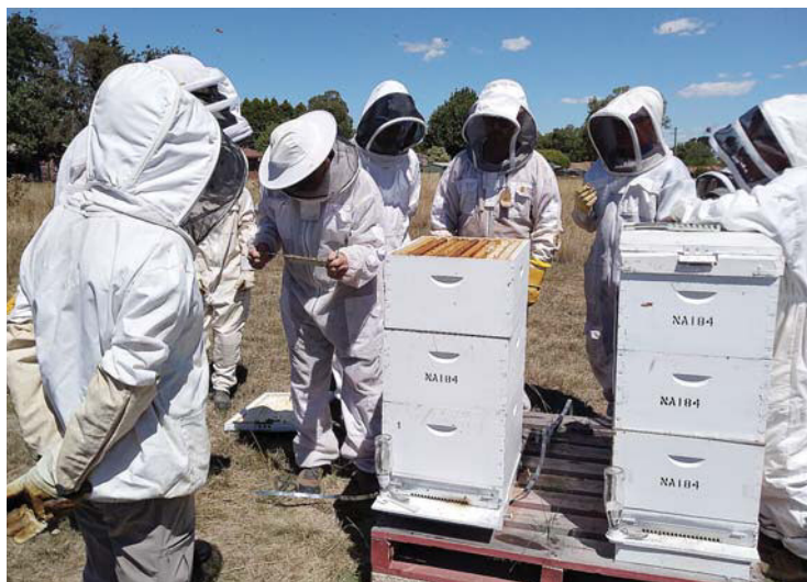
There has been a surge in amateur beekeepers in Guyra and surrounding areas.