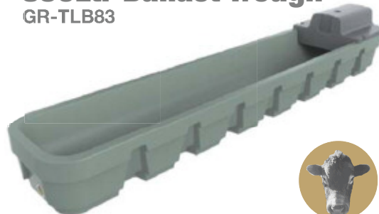
830Ltr Ballast Trough GR-TLB83