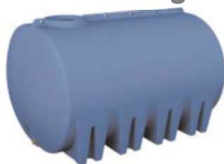
10000Ltr Cartage Tank