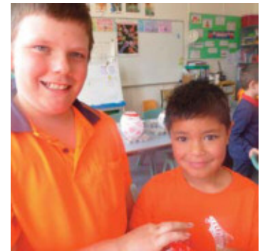
Black Mountain, Ben Lomond and Ebor Public Schools joined together to celebrate Harmony Day, sharing cultural experiences and great food.

Following the assembly, the SRC invited the visitors to join them in cutting a cake to mark Harmony Day.