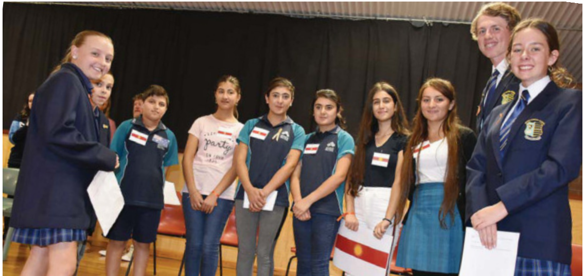
Guyra Central School Primary and Secondary Captains welcomed the Yazidi refugees

Harmony Day was marked at local schools last week, and this year the day had increased significance coming just one week after the Christchurch massacres.