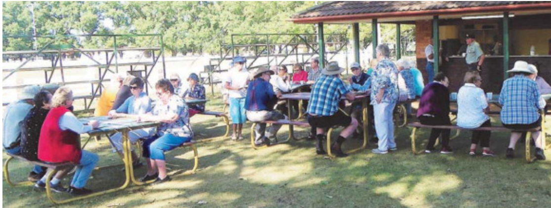
Senior's enjoyed morning tea at the Showground before heading off to Armidale