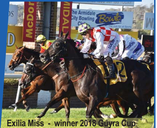
Exilia Miss - winner 2018 Guyra Cup

Armidale Jockey Club Barney Street, Armidale