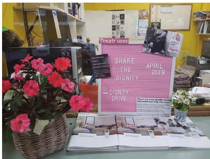
Donations of women's sanitary items can be dropped into CT Electrics during April