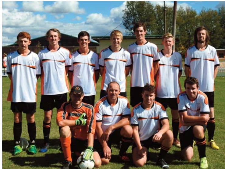
Guyra United first grade side

The start of the game was a little bit sloppy with the Caspers finding it hard to string passes together, but 20 minutes into the game a cross was put into the Highlanders box and Corby calmly slotted a header away from the Glen keeper. Celebrations were short lived when 5 minutes later a cross from the Highlanders managed to dribble over the line