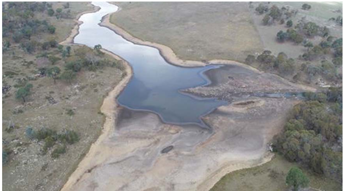
The Guyra water supply dam faces the real prospect of running dry by August

"We just don't know when this drought will break in our