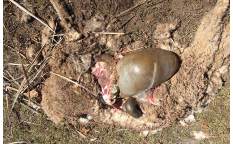
Dogs are believed to be responsible for a spate of vicious maulings around town

Last year he was the top fundraiser in the event raising $15,000. He is asking for local