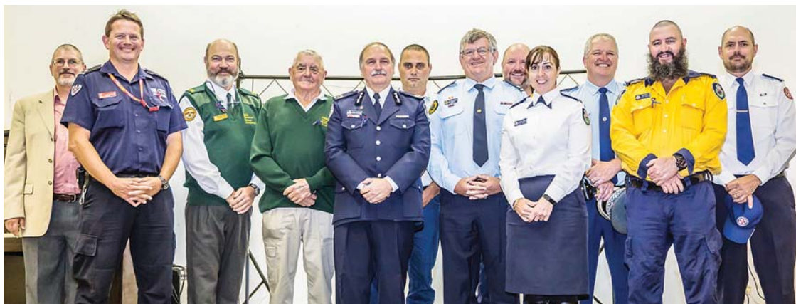
Emergency workers received a vote of thanks from the Tingha community

A highlight was the 'THANK YOU' ceremony when representatives of the police and emergency services went on