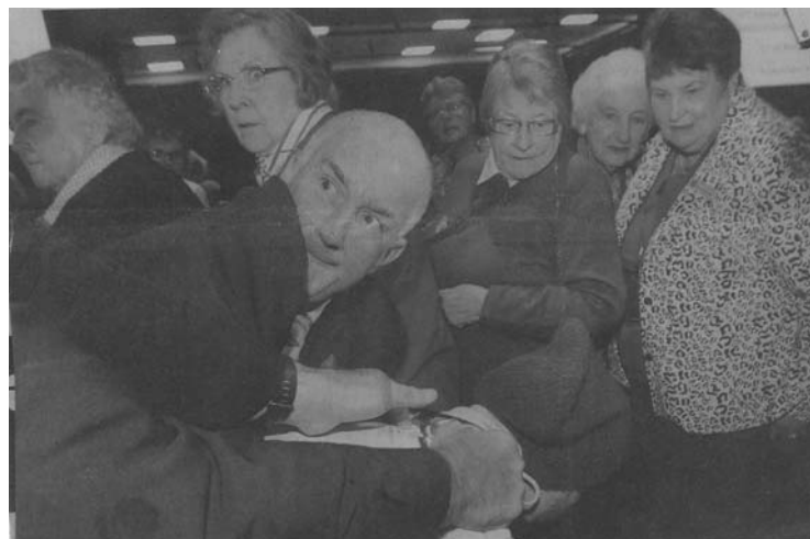
Northern Tablelands CWA delegates watch on as a detective tackles the intruder to the ground

The visit by the Prime Minister was the first surprise of the morning. Mr Morrison was made welcome and was