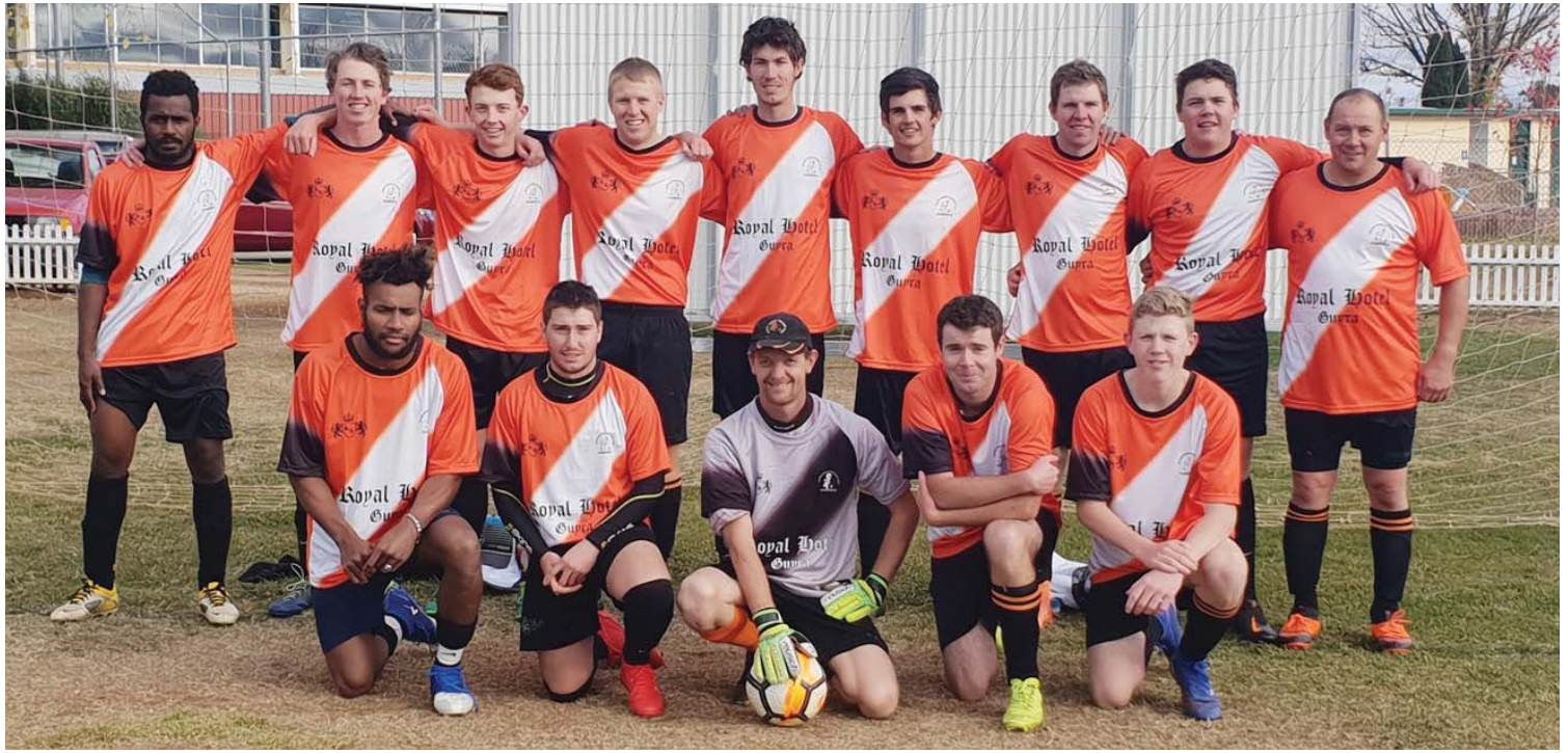
First grade suffered a loss at the hands of Inverell on the weekend

The Caspers took the field on Ladies Day in front of a healthy crowd on what was a miserable day weather wise. The Inverell side were a bit of an unknown quantity with the team made up of many Brazilians who are working at Bindaree Beef.