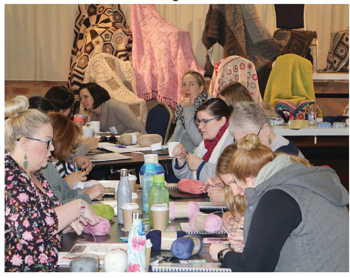
Twenty five ladies attended the crochet day on June 2nd, inspired by some beautiful blankets

On Sunday June 2nd Guyra CWA Evening Branch hosted a Learn to Crochet Day at the Guyra Bowling and Recreation Club.