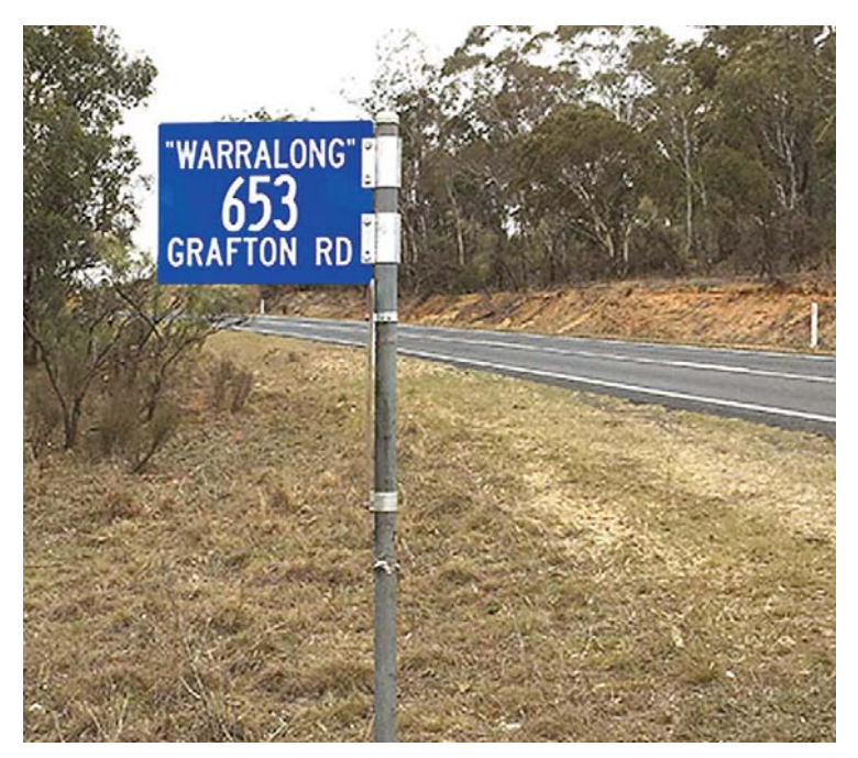
Council is offering rural residents the opportunity to purchase the signs for $300, including installation.

"This is particularly concerning for emergency serv-